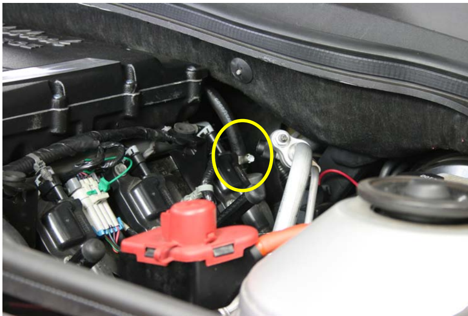
Step 5: Install hose using hose clamp.

For Technical Assistance, call Moroso's Tech Line (203)-458-0542, 8:30am-5:00pm Eastern Time MOROSO PERFORMANCE PRODUCTS, INC.