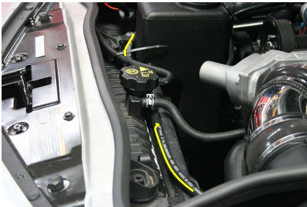
Step 8: Route hose as shown to other side of expansion tank.