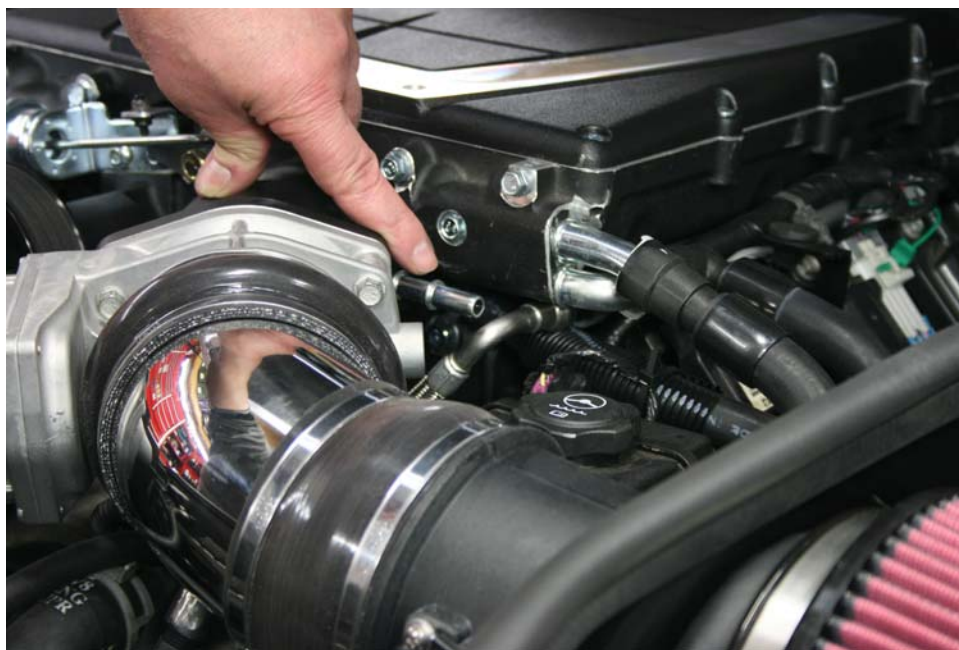
Step 3: Locate nipple on intake behind throttle body.

For Technical Assistance, call Moroso's Tech Line (203)-458-0542, 8:30am-5:00pm Eastern Time MOROSO PERFORMANCE PRODUCTS, INC.