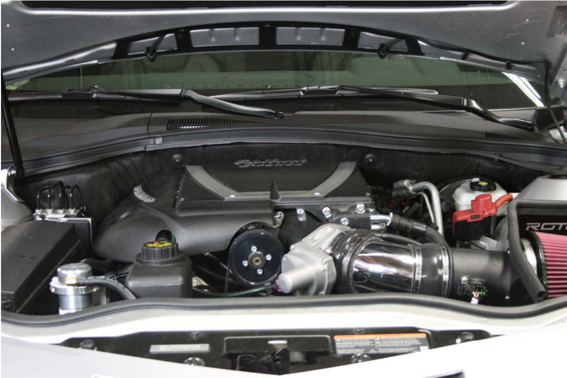
Step 16: Re-install engine covers. Installation Complete

For Technical Assistance, call Moroso's Tech Line (203)-458-0542, 8:30am-5:00pm Eastern Time MOROSO PERFORMANCE PRODUCTS, INC. 80 CARTER DRIVE GUILFORD, CT 06437 www.moroso.com