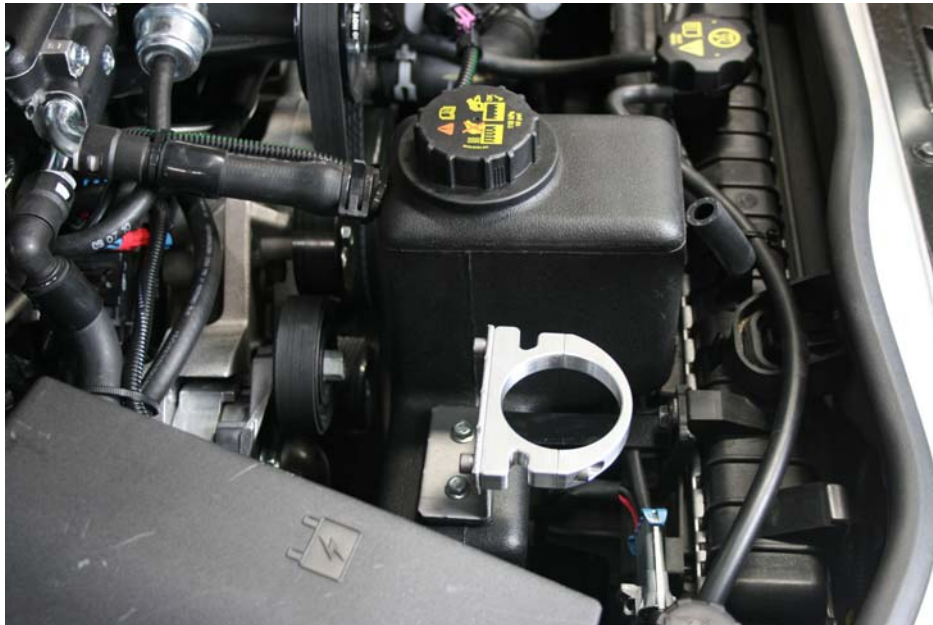
Step 13: Install mounting bracket using hardware previously removed.