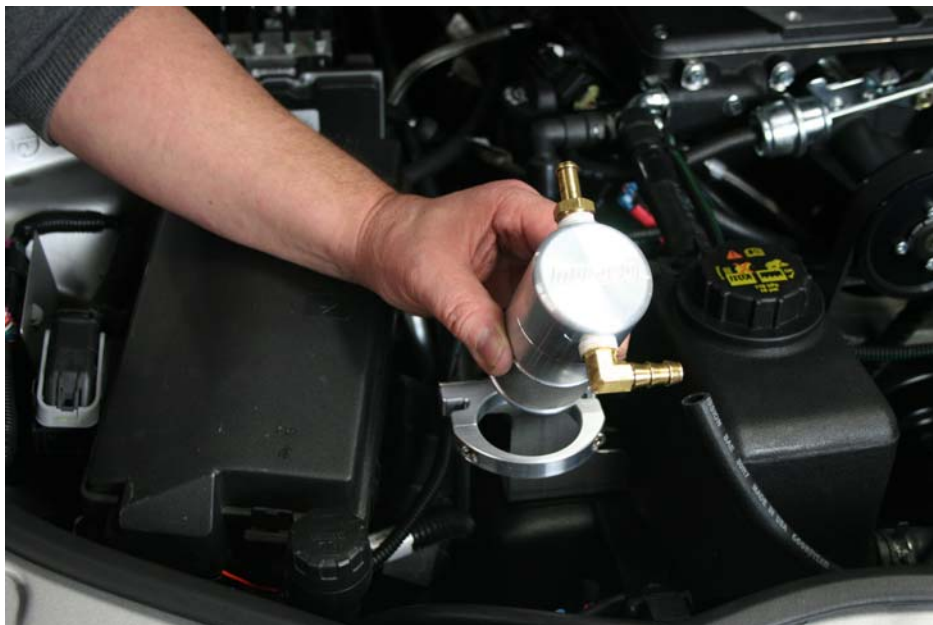
Step 14: Insert Air Oil Separator into billet clamp.

For Technical Assistance, call Moroso's Tech Line (203)-458-0542, 8:30am-5:00pm Eastern Time MOROSO PERFORMANCE PRODUCTS, INC.