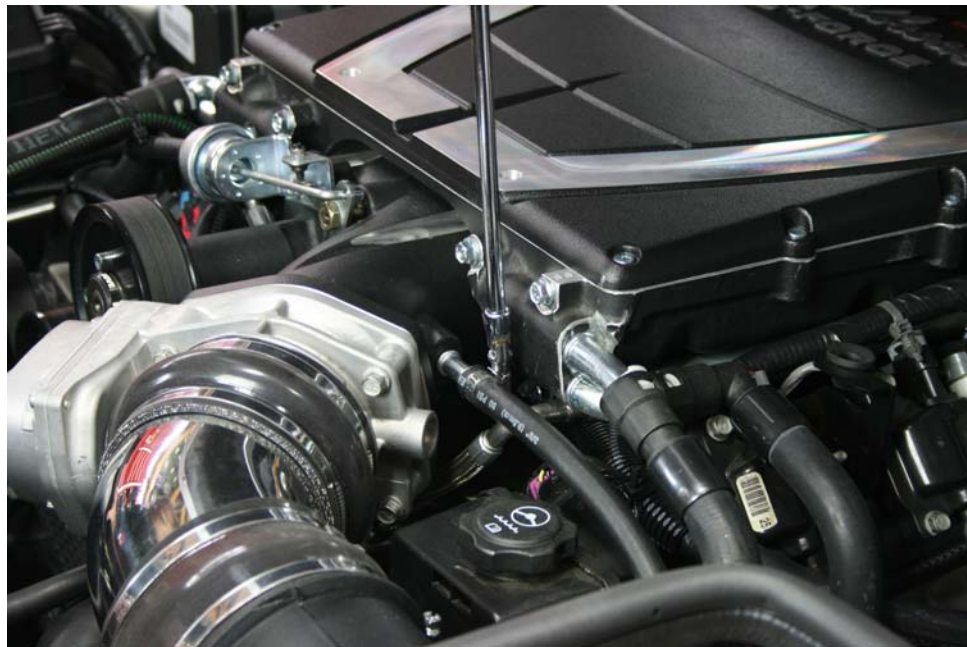
Step 7: Install 48" length of hose to intake nipple using hose clamp.

For Technical Assistance, call Moroso's Tech Line (203)-458-0542, 8:30am-5:00pm Eastern Time MOROSO PERFORMANCE PRODUCTS, INC.