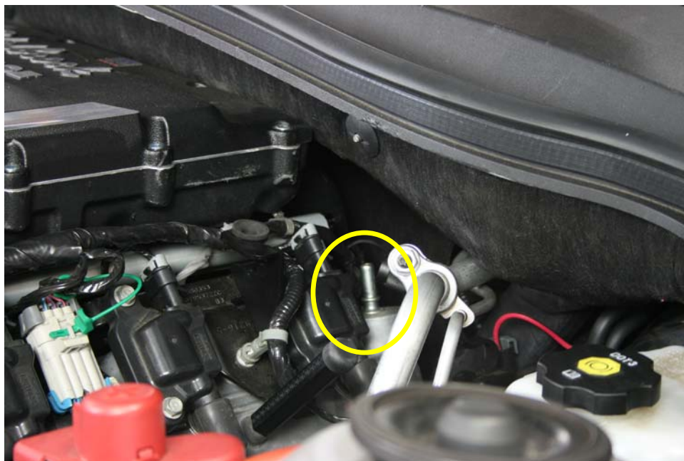
Step 2: Locate PCV nipple on driver's side rear valve cover.