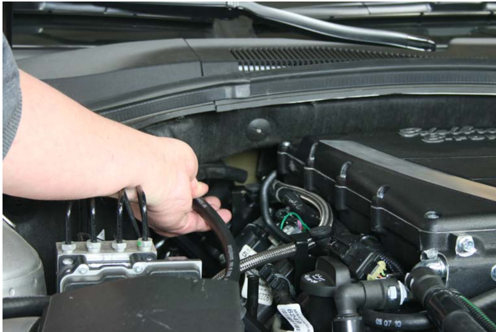
Step 4: Route 56" length of hose around back of engine to PCV nipple on valve cover.