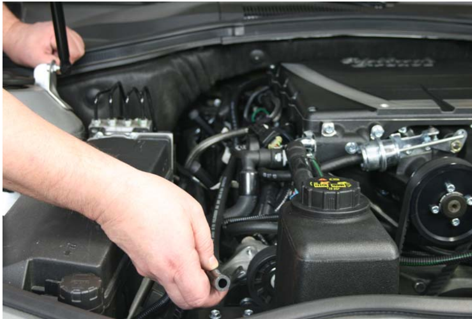
Step 6: Finish routing other end of hose to front of vehicle.